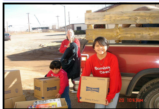
Food by the truckload! The kids are happy to help distribute food boxes to needy families! (Food donated by Northern Arizona Food Bank.)

A LOOK AT THE GREAT THINGS THAT THE LORD HATH DONE! STATISTICS O DATE: 25,000 LBS of food distributed And 25 tons of miscellaneous clothing, furniture, toys appliances and household needs to help the needy on the Navajo Reservation.