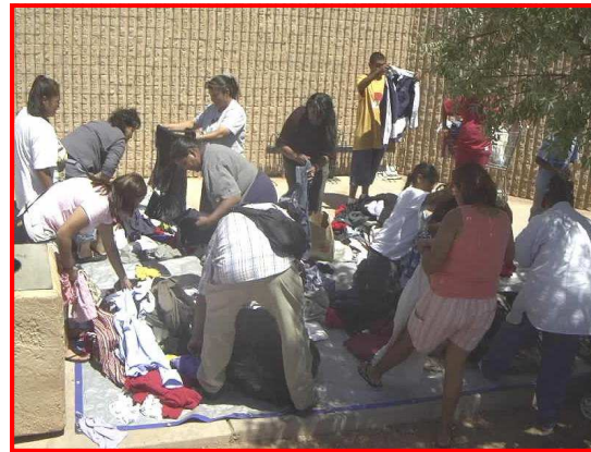
FREE CLOTHES – many gather to collect needed clothing on the Navajo Reservation.

Somebody Cares! P.O. Box 30371 Flagstaff, AZ 86003-0371 Tel 928-699-9012 Email-somebodycares4u@Q.com WWW.somebodycaresoutreach.org